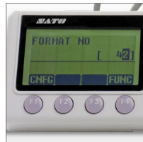
Large, Easy-to-Read LCD Display