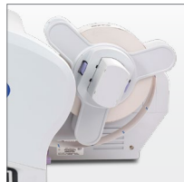
Large Media Supply