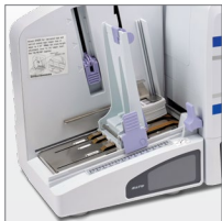
Print, Cut & Stack Operation (Stacker Optional)

Performance. Convenience. Versatility. — SATO's Specialty Series of Printers —