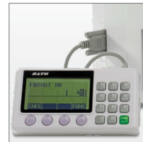
Optional Programmable Keyboard (Stand-alone Operation)