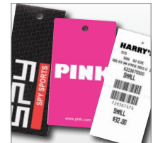
Great for Retail Tagging